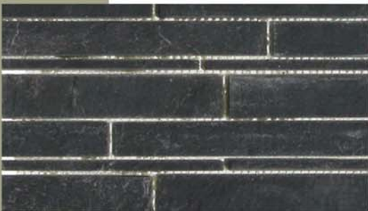
TLSL300-SLA Slate Black