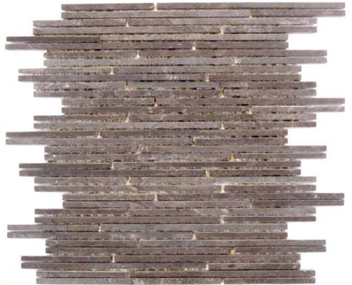
TLSL100SLA Slate Black