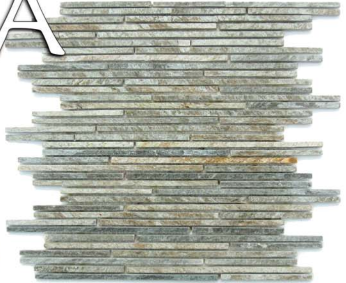
TLSL100GRA Gray Slate